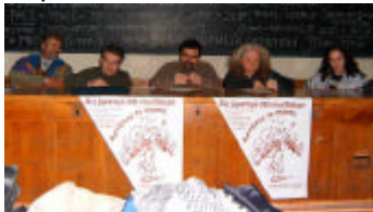
Meeting at the Polytechnic University in Athens

professor) the EBCO/WRI delegation discussed the situation of Greek alternative service working conditions and the punitive regulations. The Commission reports regularly to the Greek government on HR violations in Greece and has put the CO question many times to the Greek authorities. The Greek CO groups will provide the Commission with up to date information to draft a proposal for a new alternative service law in line with Council of Europe requirements.