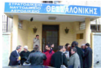
Court entrance with crowd